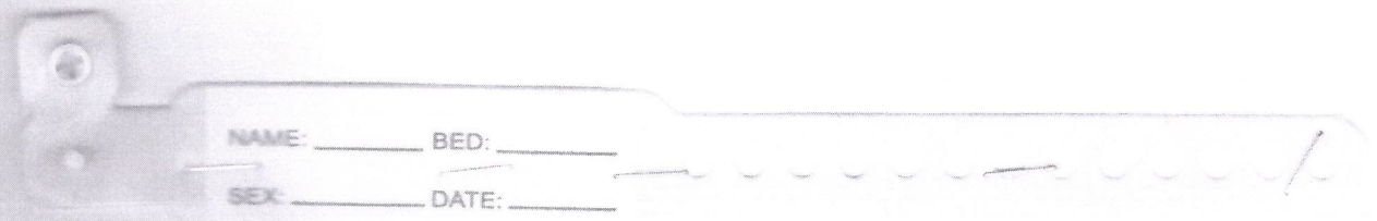
One of the existing Identification Bands (Less provisions for enough information)