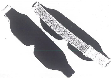
Prototype of Neonatal Eye Protector